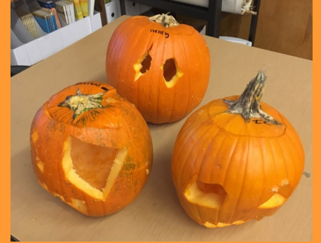
3rd Graders get messy with pumpkins!