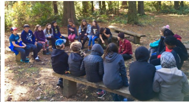
Our 6th graders had fantastic weather for Outdoor School!